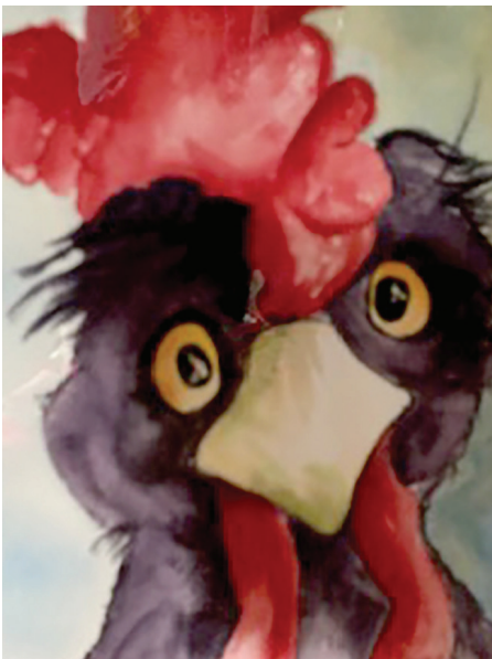
Watercolor Class is back! July 13 and 27, 2-4pm

July 15 & 16 — Strawberry Festival on Vashon VOLUNTEERS NEEDED! (See page 3 for details)