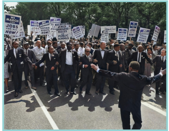
The March on Washington for Jobs and Freedom, in Washington, D.C. on Wednesday, August 28, 1963.

Black History Month celebrates achievements by Black Americans and recognizes their central role in U.S. history. Also known as African American History Month, the event is the brainchild of noted historian Carter G. Woodson and other prominent Black Americans. Since 1976, every U.S. president has officially designated the month of February as Black History Month. Other countries around the world, including Canada and the United Kingdom, also devote a month to celebrating Black history.