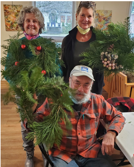
FUN Committee's December wreath making event.